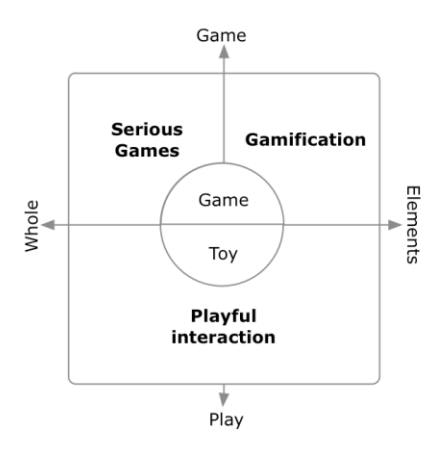
Figure 1. The relevance of serious games, gamification and playful interaction [8]

The key issue of the concept is that it is basically elements of game-playing that are designed for employment in a non-game context - and that is what sets it apart from serious games and design of playful interactions. The following figure illustrates this difference.